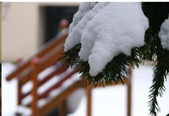
We have March Madness too!