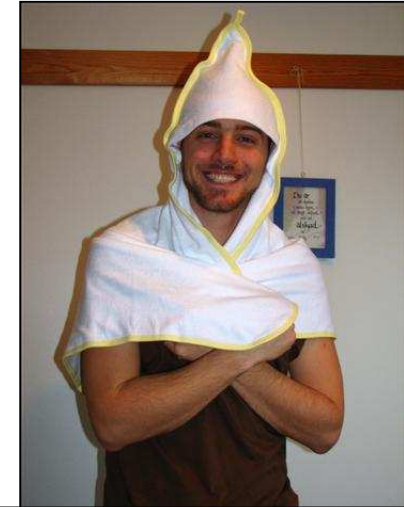
I don't know what to say?

I started my work practice last week, which means I have very little actual school work. I was unable to find a working place in a company; but it worked out that I am able to get the credits for the work practice by working for the church here! So now I am working 5-8 hours a day on ministry things such as editing teaching files, recording songs for my songbook, managing the church website a bit (happy to learn a bit more about php and html), and other things, for which I am receiving a large sum of credits towards my degree! I wasn't too disappointed to find out this was possible! Please pray for a summer job though, as it would be helpful if I can work for a month or two to help things out. We're not worried though, because God has been SO faithful so far and we believe He will continue to be so.