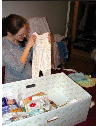
Baby box ,gift from Finland